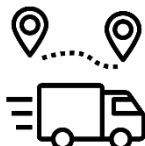
Send it back to us along with the product: